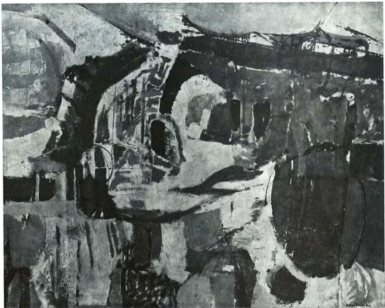
L'heure des solitudes